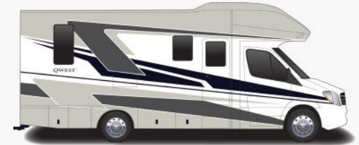
Sand Full-Body Paint