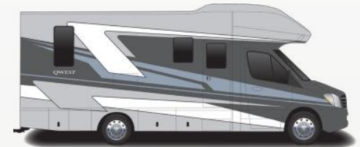
Sky Full-Body Paint