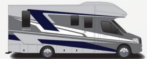
Valley Full-Body Paint