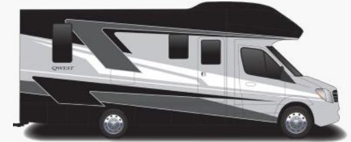
Hills Full-Body Paint